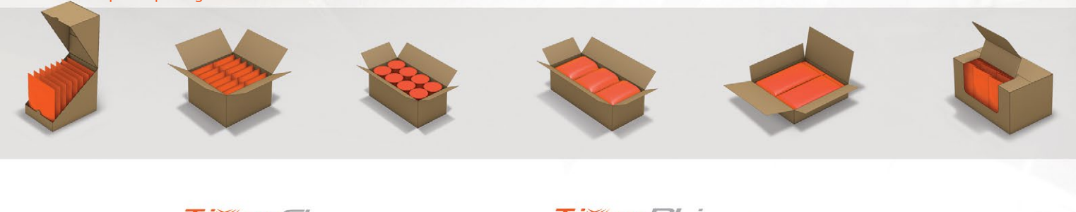
Top load packages